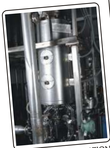
SHORT PATH DISTILLATION